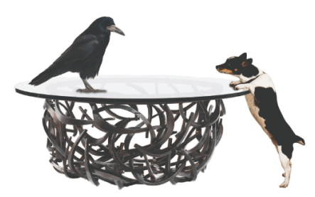
BIRD'S NEST COCKTAIL TABLE BY KOLKKA