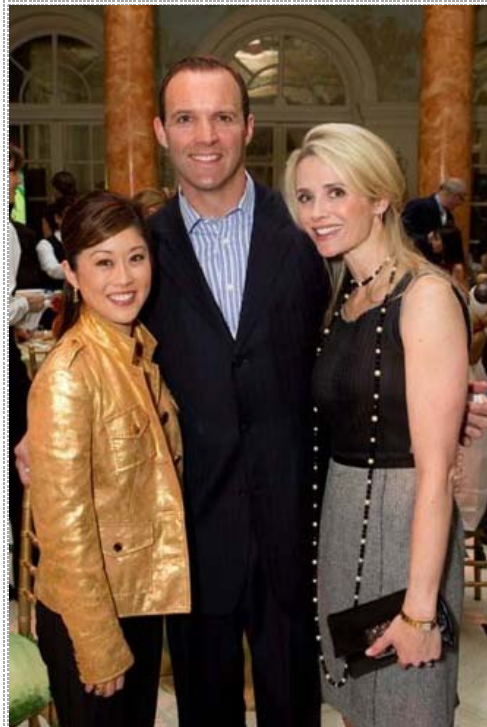
Kristi Yamaguchi, Bret Hedican, Jennifer Siebel Newsom