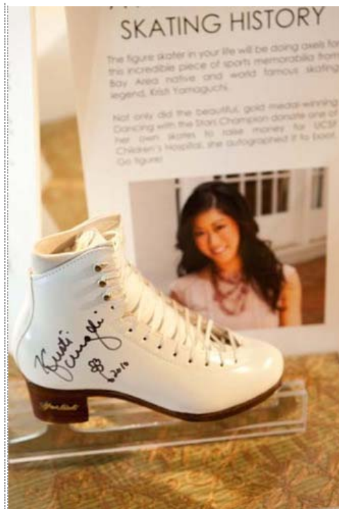
Atmosphere - Snuggly Soiree