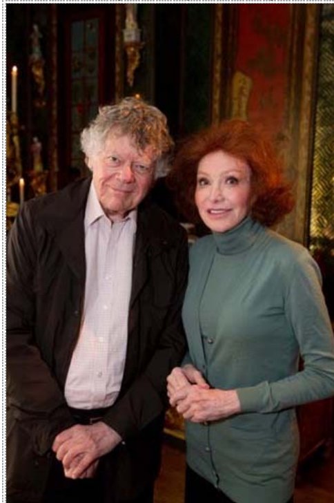
Gordon Getty, Ann Getty