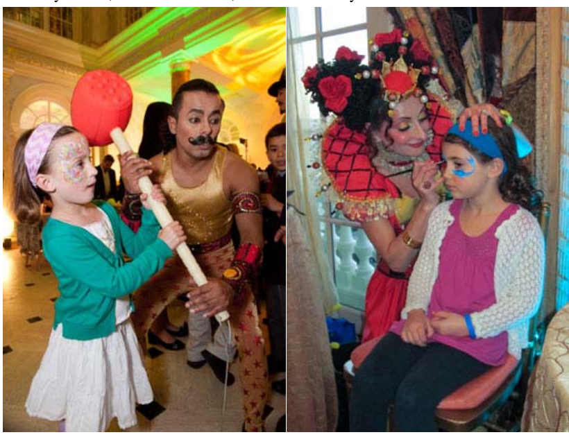
The interior courtyard was transformed into a kiddie carnival where children were delighted by storytelling, games and other activities.