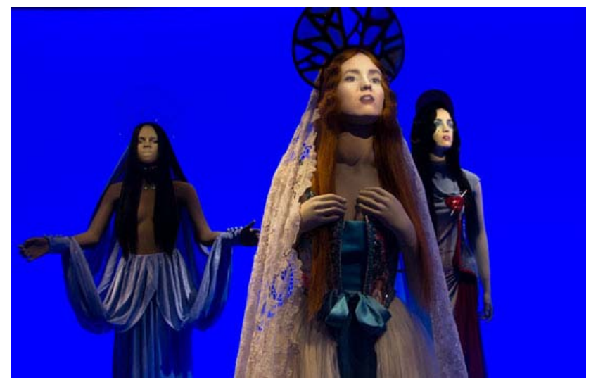
From de Young Museum's blockbuster costume exhibits: The Fashion World of Jean Paul Gaultier: From the Sidewalk to the Catwalk , celebrating the Parisian enfant terrible of haute couture.