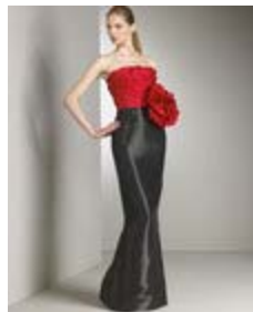
Oscar de la Renta Taffeta Gown Sold Out