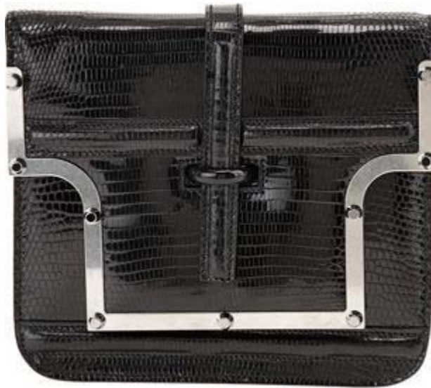
Balenciaga's Brilliant Pouchette Bague, $2,675 at Barneys New York. Lizard leather. Black. Made in Italy.

This article is sponsored by Barneys New York: