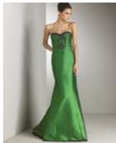
Carolina Herrera Strapless Beaded Gown Sold Out