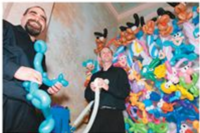
Entertainment for the kids included balloon animals, arcade games, face painting and cupcake decorating.