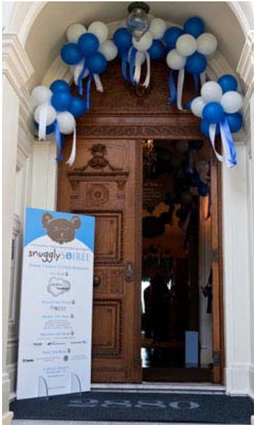
The festoons of blue and white balloons hung from the front door gave a hint of what a good time was in store.