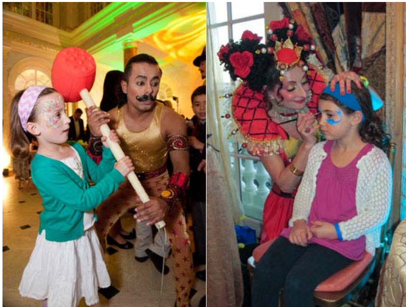
The interior courtyard was transformed into a kiddie carnival where children were delighted by storytelling, games and other activities.