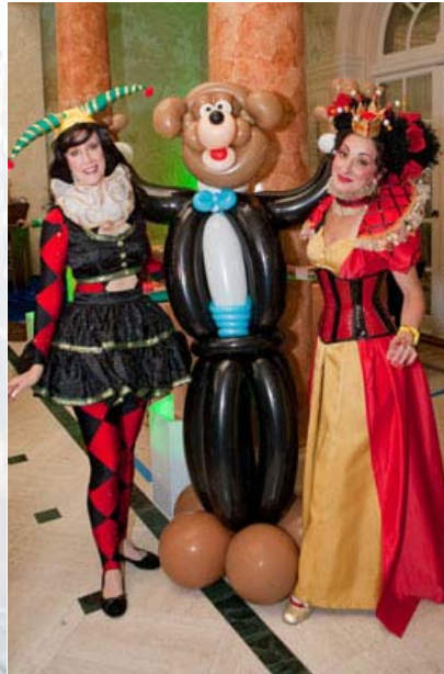
Ann and Gordon Getty hosted the benefit for the Glogau Teddy Bear Rescue Fund at the University of California San Francisco's (UCSF) Children's Hospital.

For years, the chatelaine and interior decorator Ann Getty has generously shared her Williams Polk mansion for many causes.